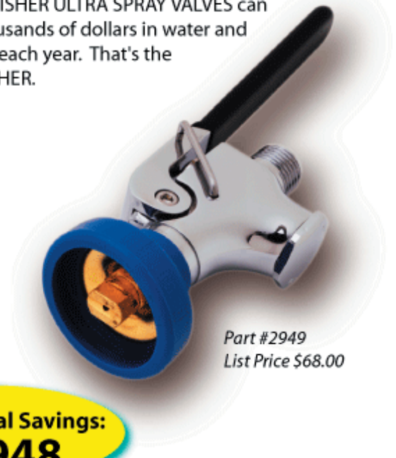
Part #2949 List Price $68.00

Discover what municipal water management councils, public utility commissions and conservationists all agree upon... that retrofitting your pre-rinse units with efficient, economical FISHER ULTRA SPRAY VALVES can save you thousands of dollars in water and energy costs each year. That's the beauty of FISHER.